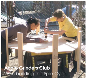
Angle Grinders Club 2016 building the Spin Cycle