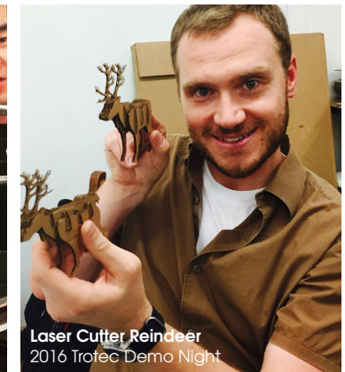
Laser Cutter Reindeer 2016 Trotec Demo Night