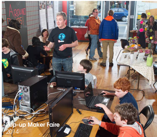
Pop-up Maker Faire 2014

Boston Makers currently is led by a five-person board and a group of 50 regular volunteers.