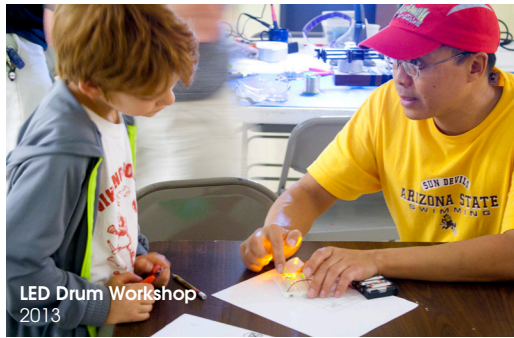
LED Drum Workshop 2013