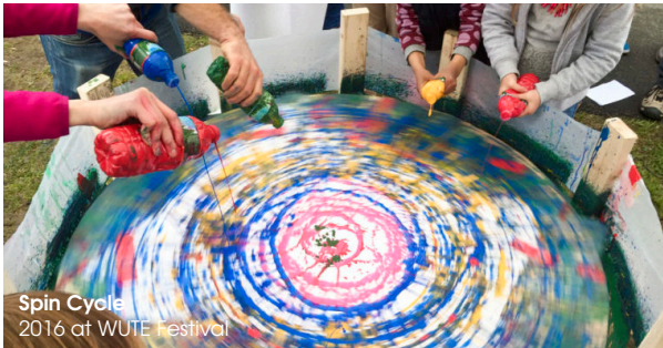
Spin Cycle 2016 at WUE Festival