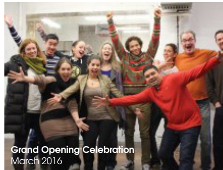
Grand Opening Celebration March 2016